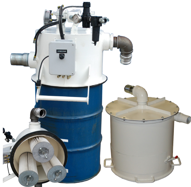
drum dust collector (left) and Reclaim Hopper

The Schmidt® Modular Vacuum Reclaim System is a convenient and portable solution used to move small or large volumes of abrasive for either recycling or removal. The system's drum dust collector easily separates dust and debris from usable "good" abrasive more efficiently than manual sieves and is significantly less fatiguing for operators. Adaptable to any existing stationary or portable blasting operation, the Modular Vacuum Reclaim System improves production and minimizes downtime in your application. Available as a full system or individual components.