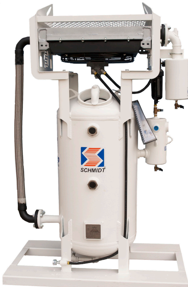
750 CFM Air Dryer (ADS)

Schmidt AirPrep Systems stand alone in the industry: they are manufactured to provide the highest levels of air treating capability with extremely low pressure drop. Available in your choice of aftercoolers or air dryers.